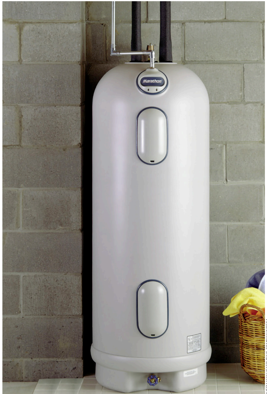
RHEEM MANUFACTURING COMPANY/NECA